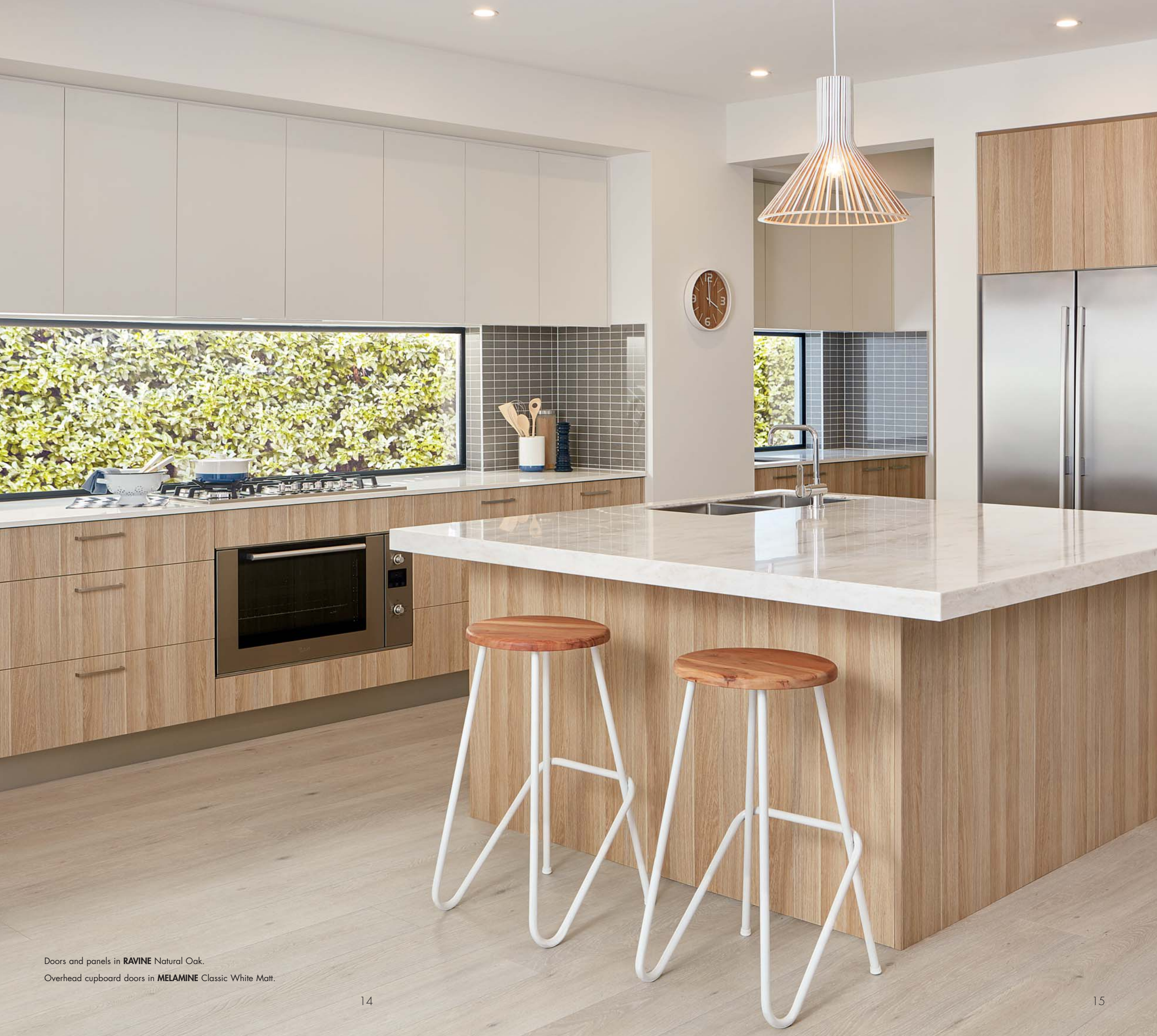
Doors and panels in RAVINE Natural Oak. Overhead cupboard doors in MELAMINE Classic White Matt.