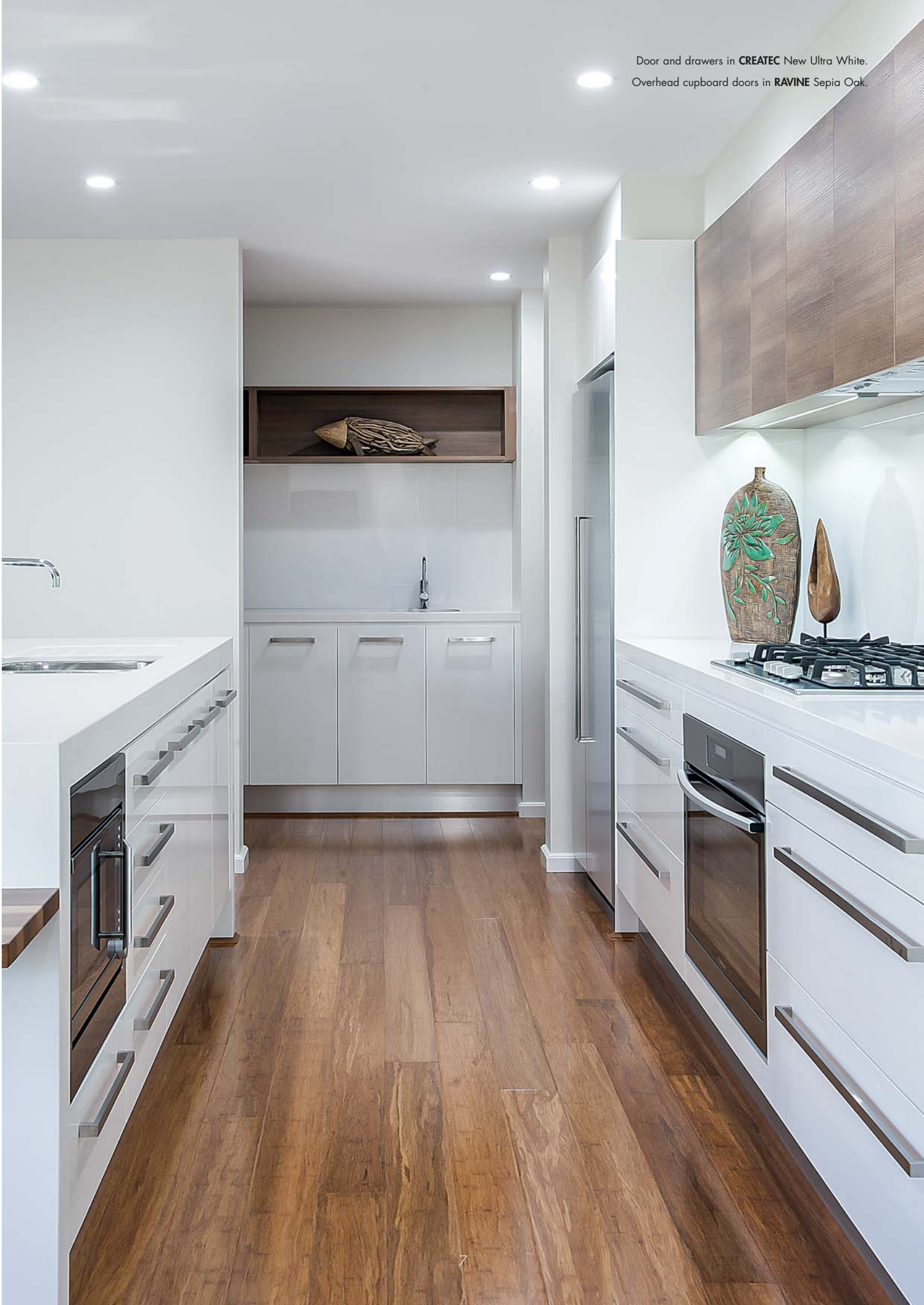
Door and drawers in CREATEC New Ultra White . Overhead cupboard doors in RAVINE Sepia Oak .