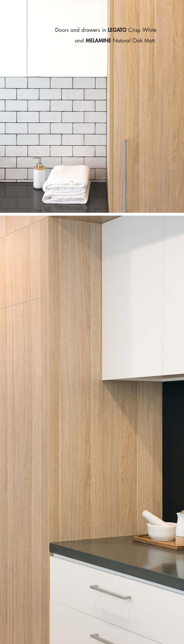
Doors and drawers in LEGATO Crisp White and MELAMINE Natural Oak Matt.