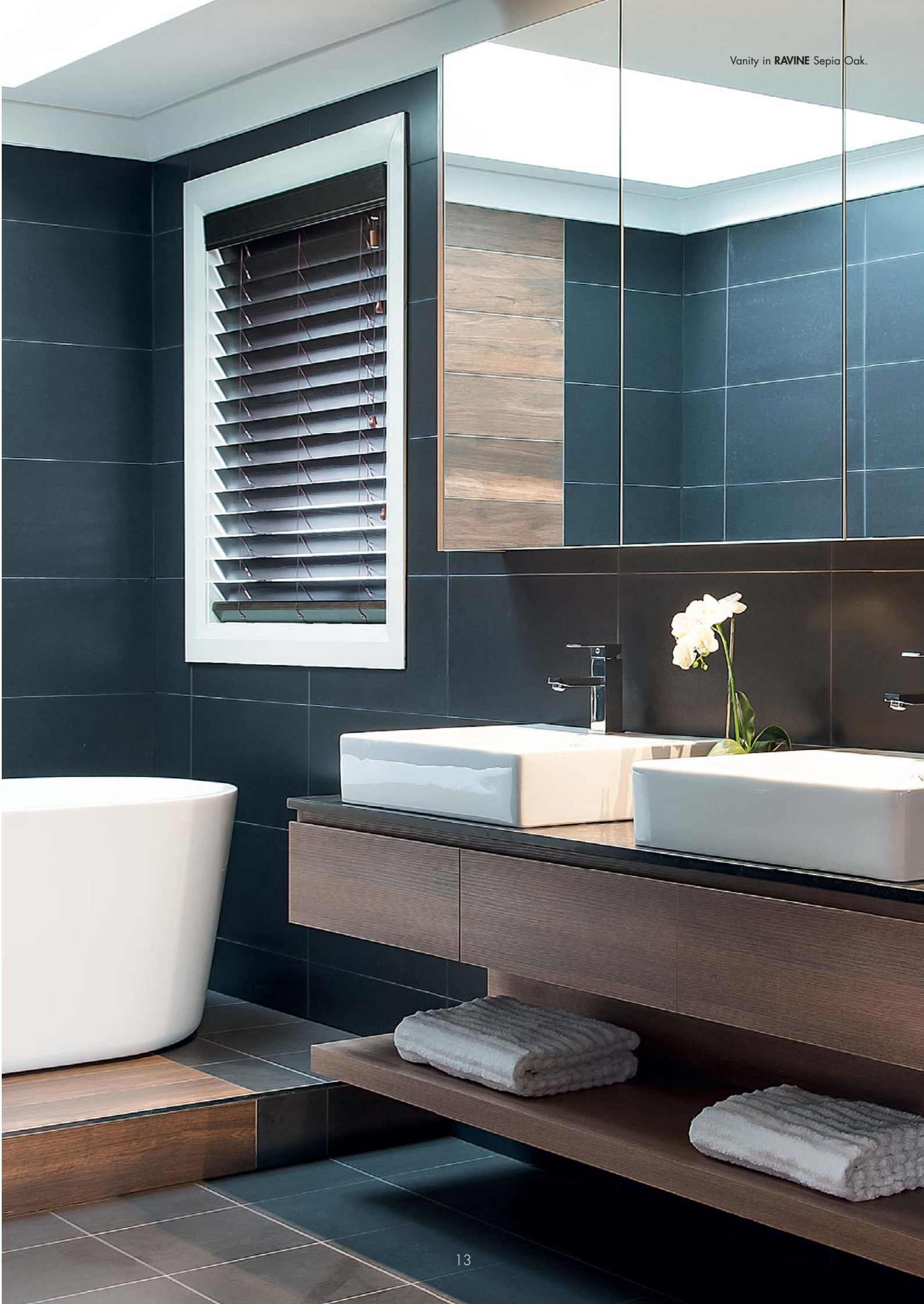
Vanity in RAVINE Sepia Oak.

Darker colours will show superficial wear and tear more readily than lighter coloured surfaces and require more care and maintenance.